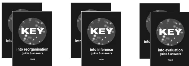
KEY into reorganisation KEY into inference KEY into evaluation and reaction