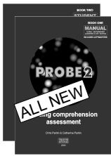
2 book kit