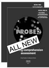
2 book kit